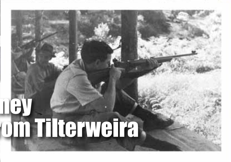
From the archives: Shooters in the past