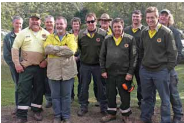
Members of the NPWS completed their annual firearm training with help from Coffs Harbour SSAA at Dairyville Range.